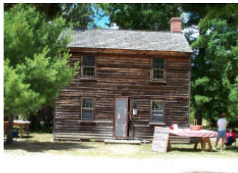
Cottage No. 42, Historic Batsto Village. Home of the Batsto Quilters.

On Sunday, July 15, 2001, the Batsto Quilters sponsored their first annual Quilters Picnic.